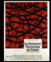
LAST TEMPTATION OF CHRIST (T