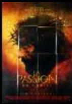
PASSION OF THE CHRIST (THE)