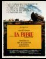
BIBLE IN THE BEGINNING (THE)