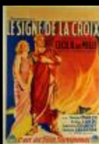
SIGN OF THE CROSS (THE)