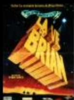
LIFE OF BRIAN / MONTY PYTHON