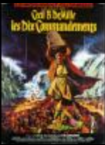
TEN COMMANDMENTS (THE)