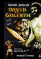
DAVID E GOLIA