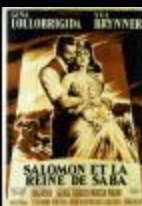
SOLOMON AND SHEBA