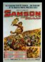
SAMSON AND DELILAH