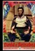
DAVID AND BATHSHEBA